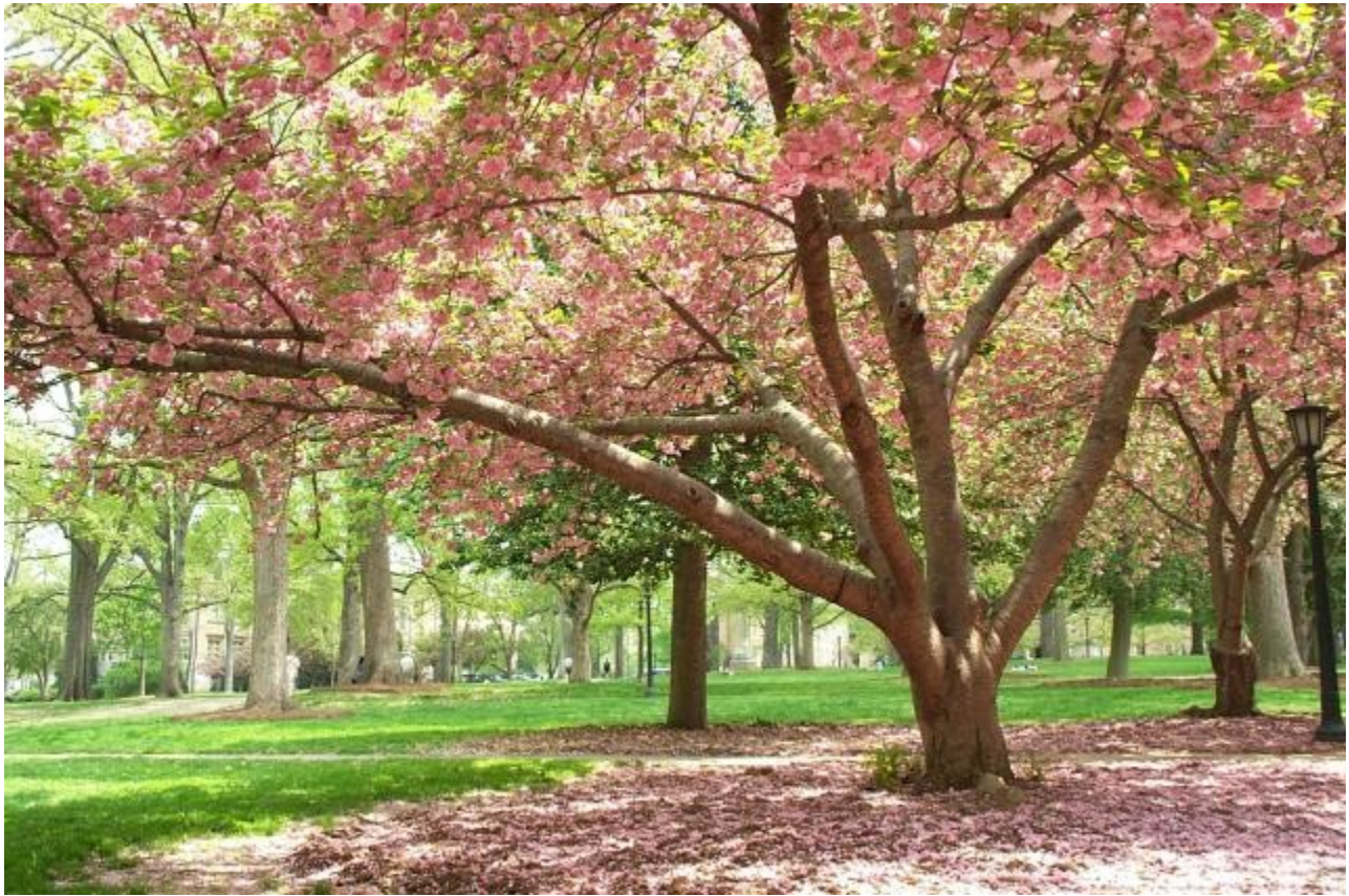
Spring in Chapel Hill N.C., a favorite picture used at the department of linguistics website

Without a moral frame of mind to guide the technological civilization, in the 21st century, there obviously is no assurance that technology will be good for civilization. The explosive finance crisis of 2008, offers a clear and vivid picture of the problem. “The finance sector has not learned fiscal responsibility from this crisis. The bailout will not recapitalize our banks and businesses; it will merely reinforce the worst habits of corporate capitalism,” commented Ashley Sanders of The Nader Team , after news of the outrageous $440,000 luxury junket AIG executives enjoyed from a bailout by the US Treasury to save them from bankruptcy.